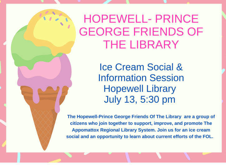
All new Friends Members get a free ARLS tote bag!